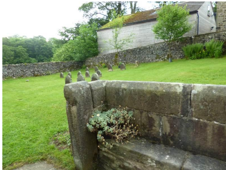
Fig.5: burial ground and stone bench set in wall, from the west

The sloping burial ground adjoins the meeting house on its south and east sides, enclosed by drystone walls. The roughly L-plan area is laid to grass with rows of head stones towards the east end; the stones have arched tops in the usual Quaker style, dating from the second half of the nineteenth century. A low ashlar wall separates the paved yard on the south-east front of the meeting house from the burial ground; the wall has an integrated stone bench to the side facing the meeting house and the top of the wall is chamfered. This unusual feature is hard to date; it is said to be seventeenth century in date, but may be later. A gateway with flat