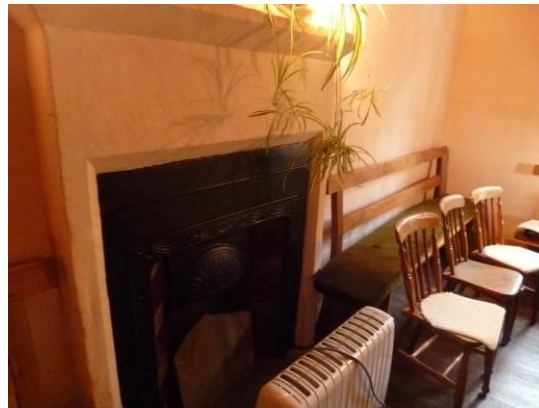
Fig.3: one of two stone fireplaces in the smaller rooms to the east end