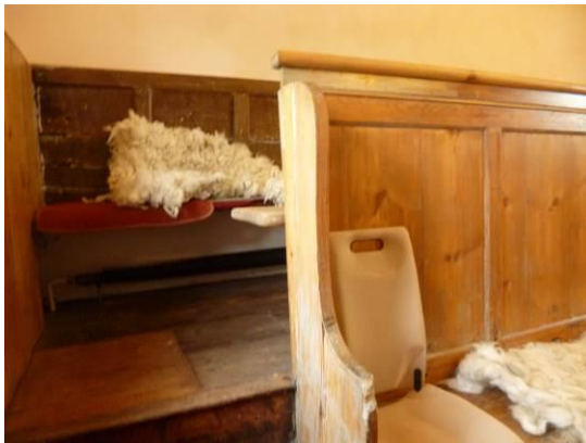
Fig.2: stand with fixed benches of varying dates

The meeting house interior is divided into two unequal spaces with the main meeting room to the south-west. The stand is against the south-west wall; this has oak panelling to the rear dado, end steps, a fixed pine bench to the front, and pine tongue and grooved dado to side walls, ramped to the stand; the pine joinery appears to be early nineteenth century in date, but the oak panelling is earlier. The smaller meeting room to the north-east is separated by a simple horizontally boarded oak screen with top-hung hinged shutters. Narrow stairs in the north-west corner lead to the gallery; the gallery floor is supported on a pair of chamfered posts and two chamfered beams with exposed joists and the gallery front is plainly panelled. The matching stone fireplaces on both floors, each have chamfered arrises and deep chamfered cornices. These fireplaces and the oak joinery are typical of the late seventeenth century. The ground floor fireplace has a nineteenth century cast-iron grate. Walls and the flat ceilings are plainly plastered with lime-wash finish. Floors are boarded in pine. The 3-bay roof has two tie-beam trusses with struts; one has curved principals.