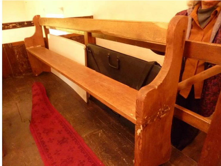
Fig.4: pine bench on gallery with back rail inscribed JB 1826

The meeting house contains a collection of pine benches of varying design, including several with reversible backs. One of the benches with solid ends on the gallery has the date 1826 on the back of the rail, perhaps re-used from another bench.